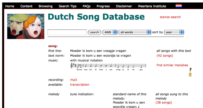
Figure 1: The Liederbank web interface