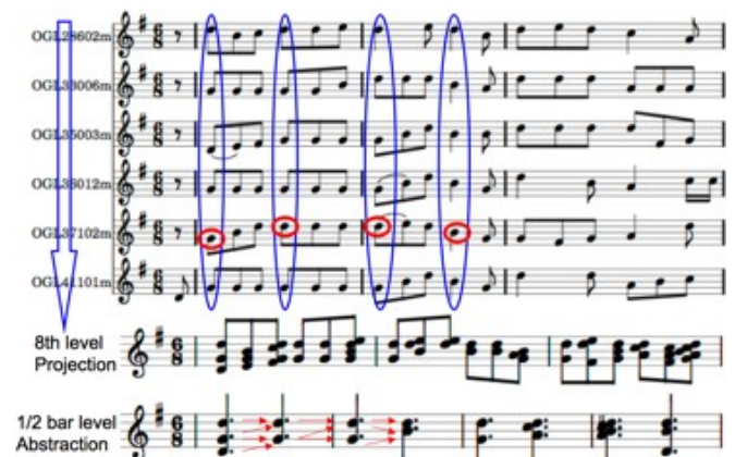
Figure 4: Alignment summarization using Humdrum tools